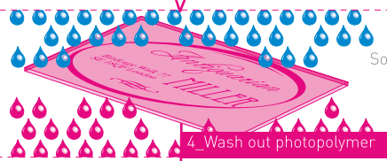
4_Wash out photopolymer